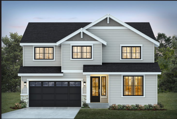
Elevation C Craftsman

4 Bedrooms | Den/Guest | Leisure Loft | 2.75 Baths | Covered Outdoor Living | 2 Car Garage