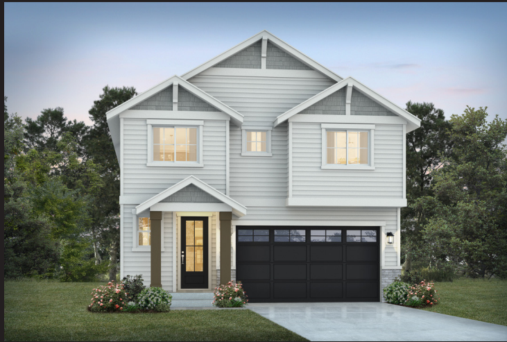
Elevation C Craftsman

4 Bedrooms | Leisure Loft | 2.75 Baths | Covered Outdoor Living | 2 Car Garage