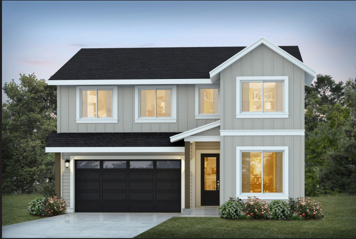
Elevation A Modern Farmhouse

4 Bedrooms | Den/Guest | Bonus Loft | 2.75 Baths | Covered Outdoor Living | 2 Car Garage