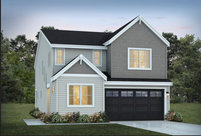
Elevation C Craftsman

5 Bedrooms | Den/Living RM | Bonus Loft | Pocket Office | 2.75 Baths | Covered Outdoor Living | 2 Car Garage