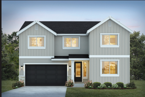
Elevation A Modern Farmhouse

3 Bedrooms | Den/Guest | Leisure Loft | Media RM | 2.75 Baths | Covered Outdoor Living | 3 Car Tandem Garage