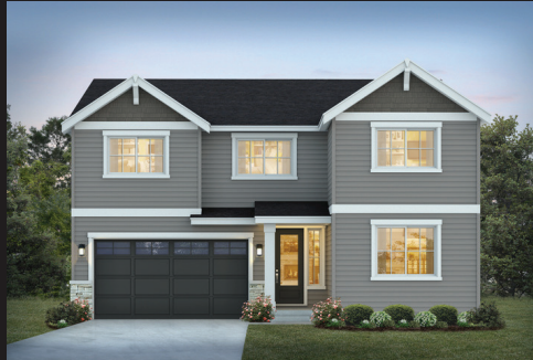
Elevation C Craftsman