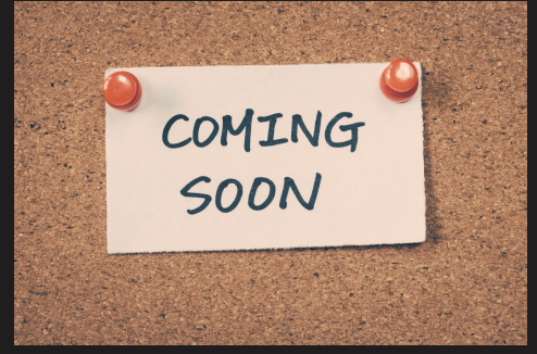
Elevation D Transitional