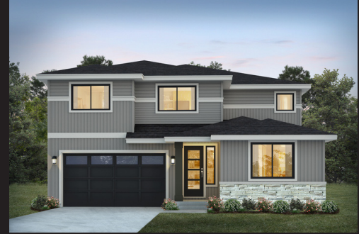
Elevation D Transitional