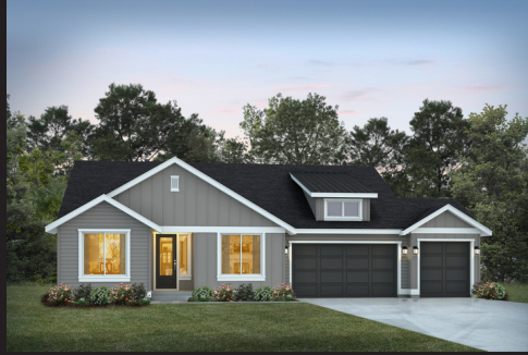
Elevation A Modern Farmhouse

3 Bedrooms | Den/Guest | 2.75 Baths | Covered Outdoor Living | 3 Car Garage