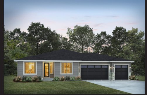
Elevation D Modern Transitional