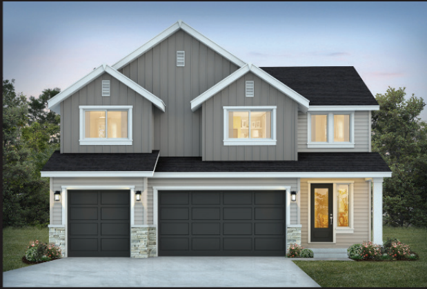
Elevation A Modern Farmhouse

3 Bedrooms | Den | Leisure Loft 2.75 Baths Covered Outdoor Living | 3 Car Garage