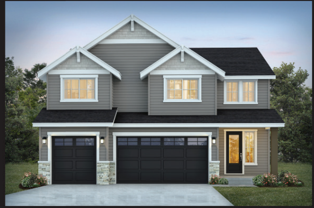
Elevation C Craftsman