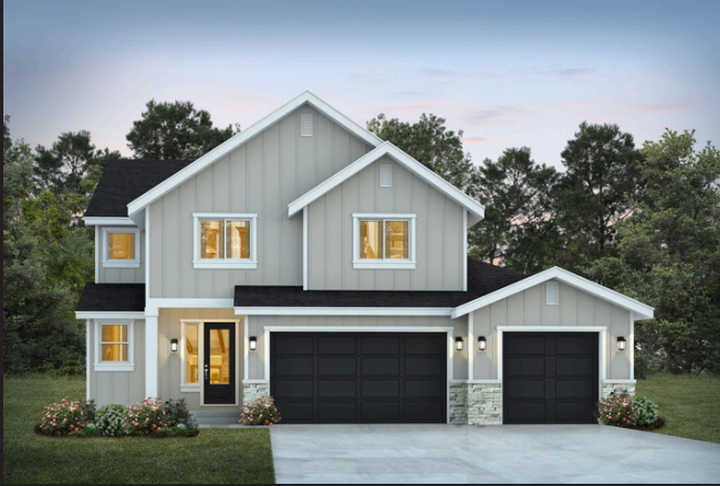
Elevation A Modern Farmhouse

Multi-Gen on Main | 3 Bedrooms | Leisure Loft | 2.75 Baths | Covered Outdoor Living | 3 Car Garage