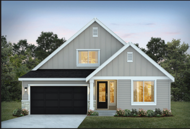
Elevation A Modern Farmhouse

3 Bedrooms | Den | Bonus/Media Loft | 1.75 Baths | Covered Outdoor Living | 2 Car Garage