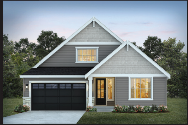
Elevation C Craftsman