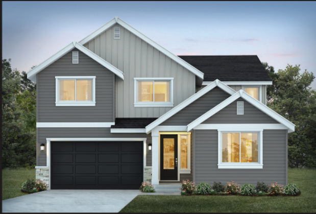
Elevation A Modern Farmhouse

3 Bedrooms | Den | Leisure Loft | 2.75 Baths | Covered Outdoor Living | 3 Car Tandem Garage