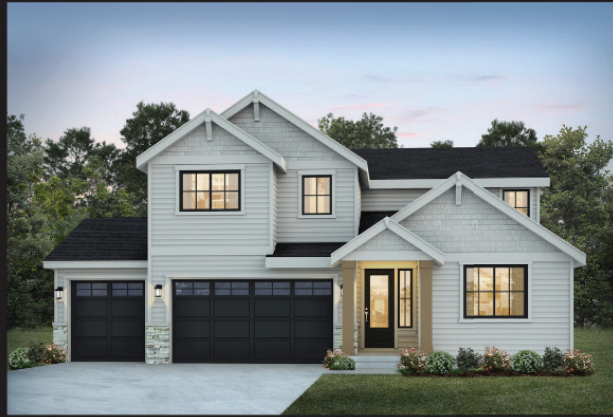
Elevation C Craftsman

4 Bedrooms | Office Alcove | 2.75 Baths | Covered Outdoor Living | 3 Car Garage