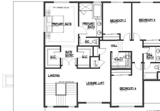
UPPER LEVEL FLOOR PLAN