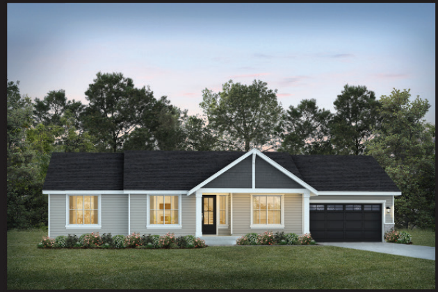
Elevation C Craftsman