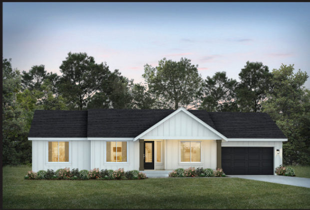
Elevation A Modern Farmhouse

Rambler | 3 Bedrooms | Office | 2.5 Baths | Covered Outdoor Living | 2 Car Garage