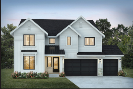
Elevation A Modern Farmhouse

5 Bedrooms includes Den/Guest | Bonus Loft | 2.75 Baths | Covered Outdoor Living | 3 Car + Storage Garage