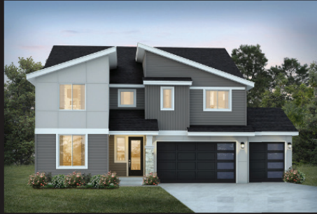
Elevation B Modern Farmhouse