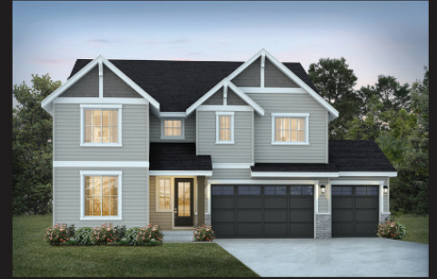
Elevation C Craftsman