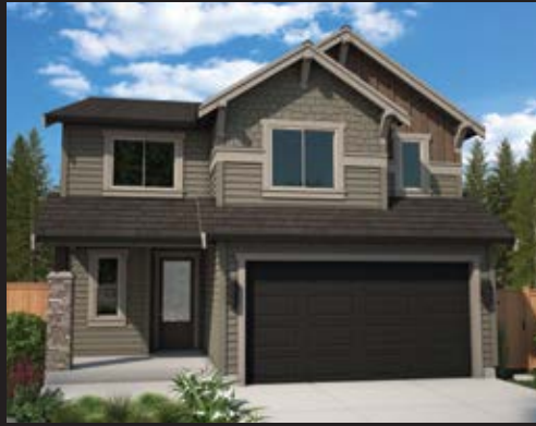
The Mt Etna NORTHWEST