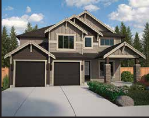
Mt Adams NORTHWEST