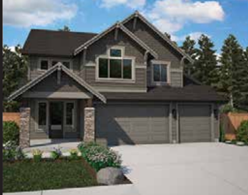
The Mt Victoria