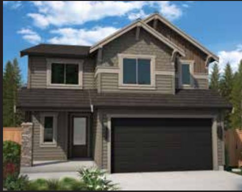
The Mt Etna NORTHWEST