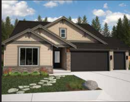
The Mt Cooke