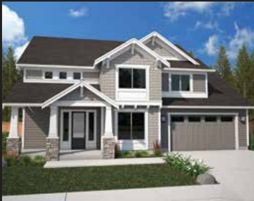
The Harbor Cove