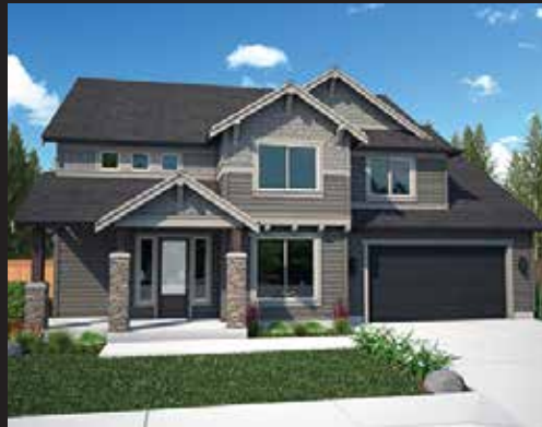
The Mt Shasta