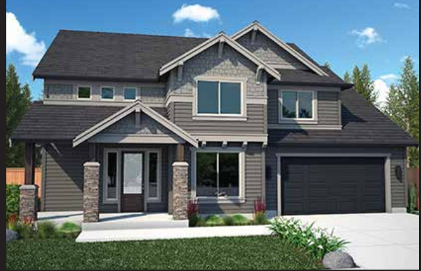
The Mt Shasta