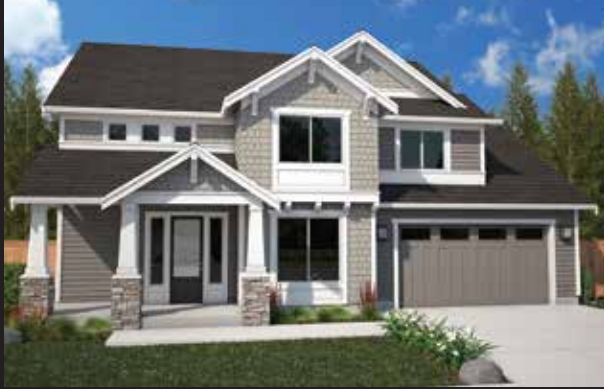
The Harbor Cove