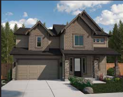
The Mt Baker