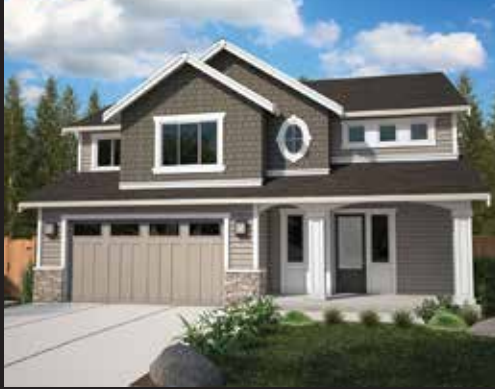
The Timber Cove