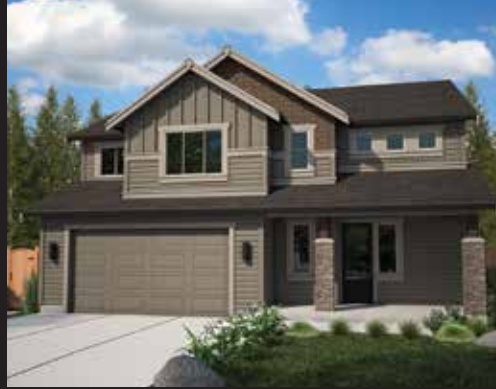
The Mt Peak