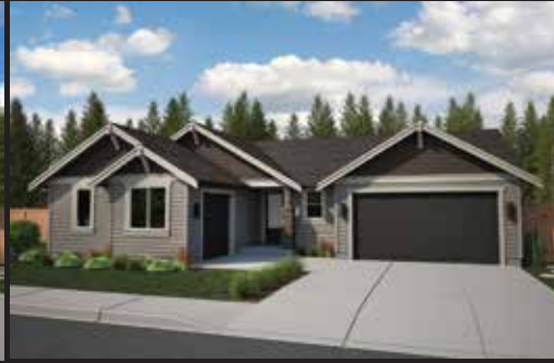
Mt Baker NORTHWEST